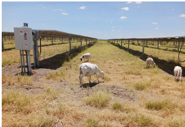
Fig 1. Revegetation substantially reduces the small temperature increases under a solar array